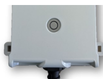
Power activation icon

Press power icon with gentle force to activate